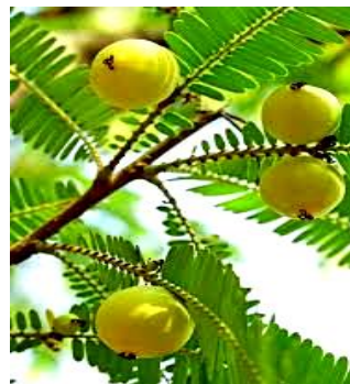
Fig 1: Amla Plant

Biological source: This is consists of dried as well as fresh fruits pericarp of the plant Emblica officinalis Gaerth Phyllanthus emblica Linn. It contains not less than 1.0% w/w of Gallic acid calculated on dry basis.