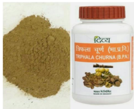
Fig 6: Divya Triphala Churna