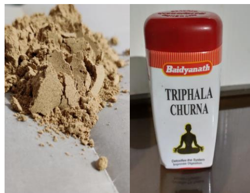
Fig 7: Baidyanath Triphala chura