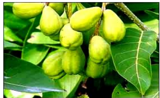
Fig 3: Harde Plant

Biological Source: It consists of dried, ripe & fully matured fruits of Terminalia vhebula Retz. It contains not less than 5% of chebulagic acid & not less than 12.5% of chebulinic acid.