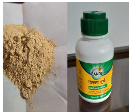
Fig 5: Zand Triphala Churna