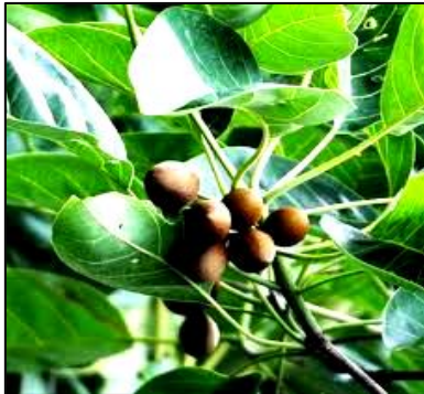
Fig 2: Baheda Plant

Biological source: It consists of dried ripe fruits of the plant Terminalia bellerica Linn.